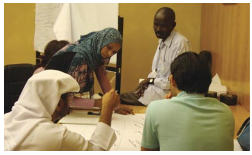
Participants at a security training work through an Analysis of Actors

In this Chapter, we will look at some reasons why a context analysis can be useful, with whom and when to do it. We introduce two tools for context analysis – Context Analysis Questions and an Analysis of Actors. There is also a simpler tool in Appendix 1 – SWOT (Strengths, Weaknesses, Opportunities, Threats) Analysis.