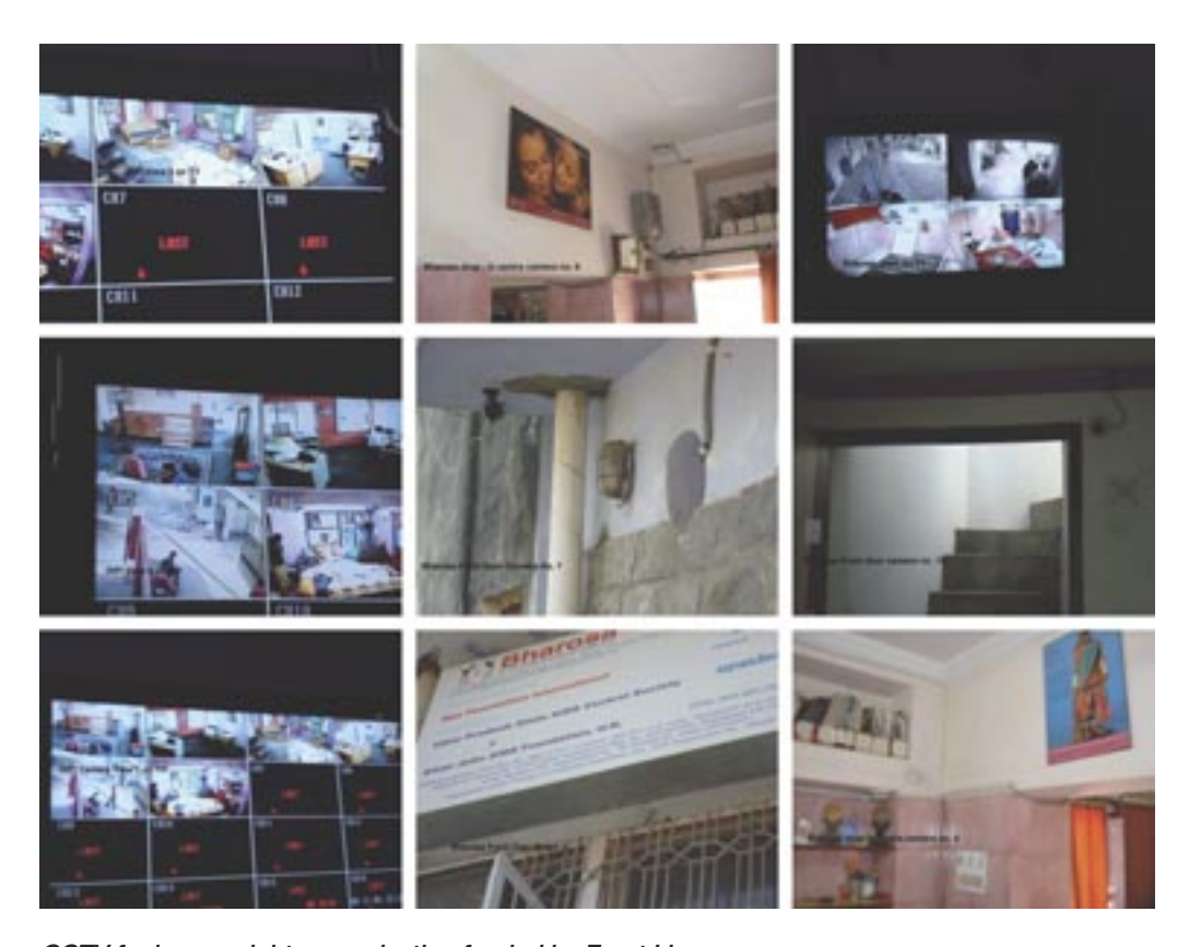
CCTV for human rights organisation funded by Front Line