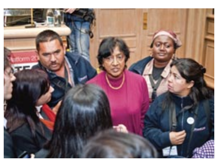
HRDs at the Dublin Platform networking with Navi Pillay, UN High Commissioner for Human Rights

If you have not already done so, plot each of the risks on the Risk Matrix (Fig 3.5) by assessing how likely they are to happen (their probability) and what impact they will have on you if they do in fact occur. To do this you will use your experience and knowledge of the political situation. It is a subjective assessment.