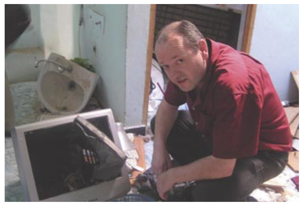
Aftermath of police raid, Western Sahara

2.1.1 Bring together all your trusted colleagues to discuss and list the risks you face as an organisation and as people working within the organisation. Including as many staff as possible in this discussion will begin to build security awareness and commitment to adhere to security measures. Support staff such as the receptionist and driver may not be the most at risk, but they may be the first to spot security incidents. Encourage everyone to contribute and consider each contribution seriously.