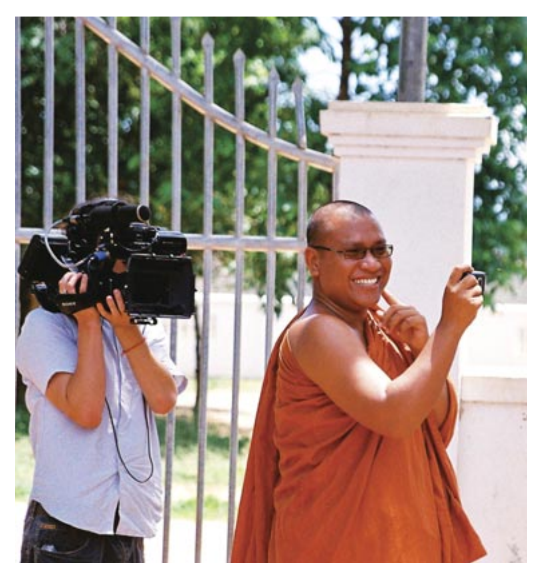
Documentary made of HRD the Venerable Sovath Luon (right) helped raise profile and provide protection