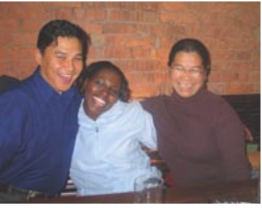
Relaxing after a workshop

Exercise – stress produces chemicals in the body to prepare us for fight or flight. Fight or flight may have been the best strategies when humankind hunted wild animals to survive, but for most of us, times have changed! Exercise is a healthy way to reduce these stress chemicals. Aim for 30 minutes of activity, such as walking, each day. Three to 4 times a week,