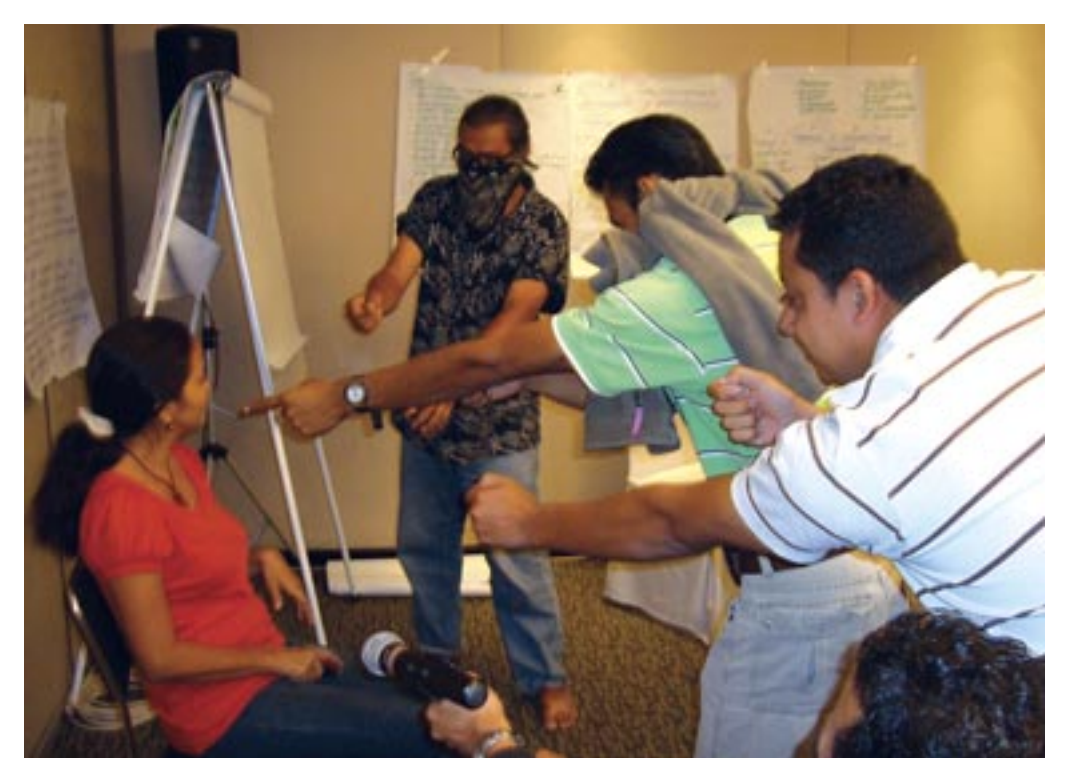
Role play of attack by armed men on a WHRD, illustrating a security plan in action