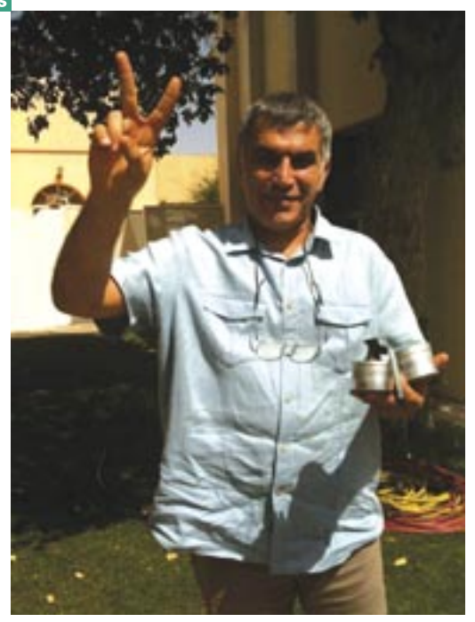
Nabeel Rajab, Bahrain with tear gas canisters fired on his home