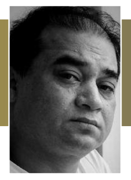
ILHAM TOHTI, CHINA Sentenced to life imprisonment for defending the political and cultural rights of the Uyghur people