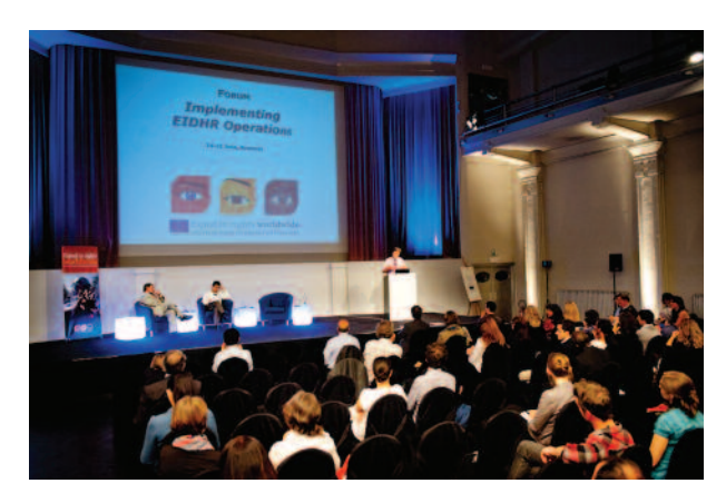
European Instrument for Democracy and Human Rights (EIDHR) forum, Brussels, 2011