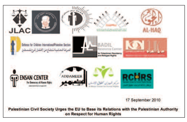
Palestinian NGOs issue joint statement to the European Parliament

Good Practice: EU Special Representative raises Uzbek human rights defenders cases.