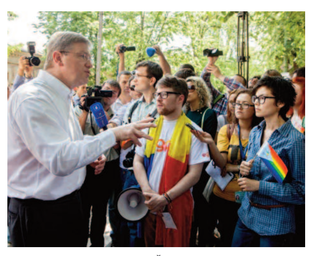
European Commissioner Štefan Füle attends LGBT rally in Moldova.

As a consequence of HRDs' work, family members of HRDs may be threatened or attacked. While the EU does not explicitly mention family members of HRDs in its commitments, HRDs should nevertheless include family members at risk when requesting EU protective action. EU commitments relate to HRDs working at both registered and non-registered organisations.