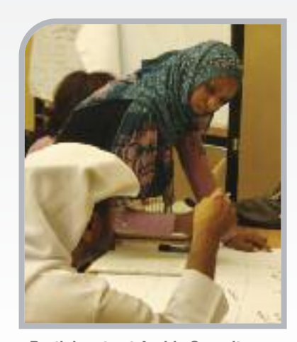
Participants at Arabic Security Training in Beirut.