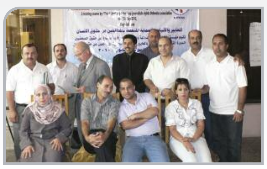
Front Line training course in Baghdad.