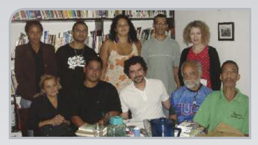
Front Line meeting HRDs from Rio State in the office of Justiça Global.