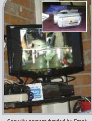
Security camera funded by Front

rights defender who had been sexually assaulted.